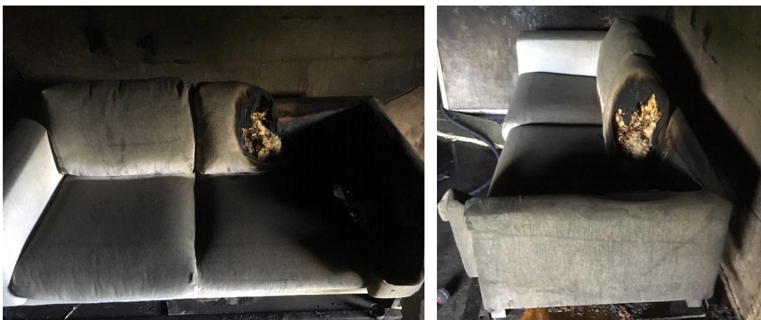
Figure 2.20 Effect smoke-resistant separation and mobile water mist system, defensive interior tactic

In the second experiment of the day a defensive attack was carried out. The mass loss of the sofa was approximately 1-5 kg. Figure 2.20 shows the pictures of the sofa, taken after this experiment.