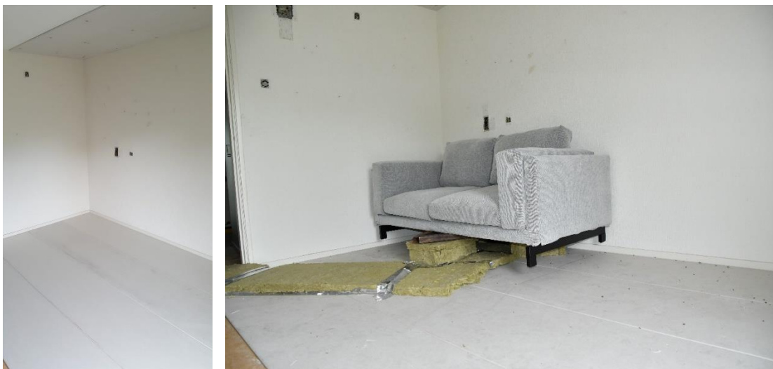
Figure 1.5 Prepared fire room with the fire load in place

The sofa was put in a corner of the room, against the wall of the bathroom and the adjacent apartment. This was done to ensure a quicker spread of the fire, as compared to that of a fire starting in an object standing in the middle of the room. The sofa was placed on top of a scale, to measure the mass loss of the fire load during the fire. During the fire development, the mass loss of the sofa was measured over time, resulting in a fire growth curve of the peak heat release rate. The scale was calibrated in advance to be able to determine the mass loss of the sofa for each scenario. The mass of the sofa before ignition of the fire was circa 86 kilograms (kg); this is the 'starting weight'. Measurements of the mass loss rate and measurements of smoke gasses during each test provide insight in the release of various smoke gasses and other products of combustion over time. The prepared fire rooms are shown in figure 1.5.