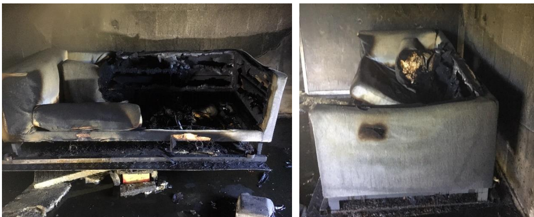
Figure 2.18 Effect mobile water mist system, offensive interior tactic, door open

An offensive interior attack was deployed during the second experiment of the day. The front door was open. The mass loss of the sofa was approximately 10-20 kg. In figure 2.18 the pictures of the sofa taken after this experiment are shown.