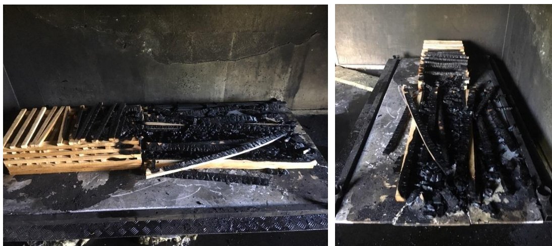
Figure 2.23 Effect organic fire load, defensive interior tactic

During the second experiment of the day, the front door was open and a defensive interior attack was carried out. The starting weight of the organic fire load was 22.1 kg. The mass loss of the organic fire load was approximately 11-12 kg; the peak heat release rate was approximately 0.2-0.35 MW. The pictures of the remains of the organic fire load are shown in figure 2.23.