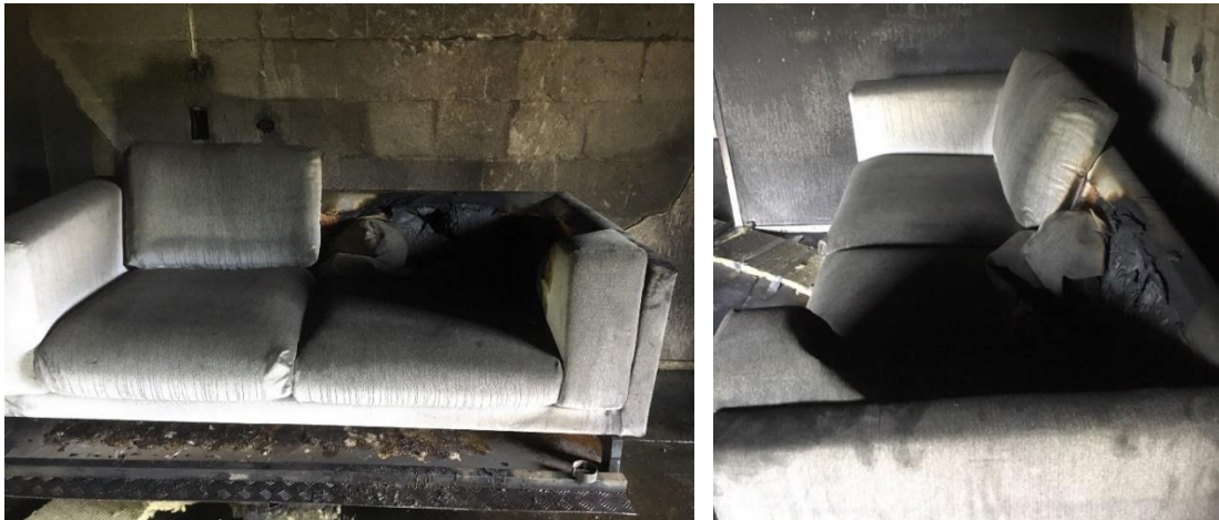
Figure 2.17: Effect mobile water mist system, defensive interior tactic, door closed

the igniting the fire the crew entered the fire room. The mass loss of the sofa was approximately 1-5 kg. Figure 2.17 shows the pictures of the sofa after this experiment.