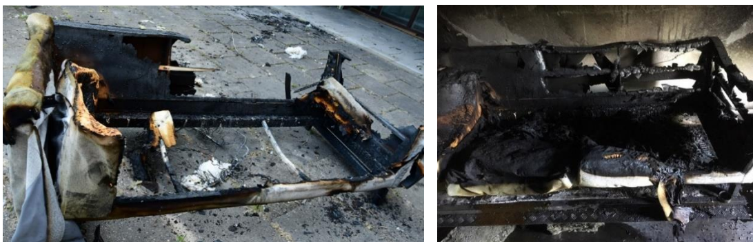
Figure 2.4 Pictures door open, offensive interior tactic

During the experiment with the door open and an offensive interior attack, the mass loss of the sofa was 15-25 kg. Due to failure of the scale no reliable data of the mass loss rate is available. The mass loss over time is estimated on the pictures and scale measurements before and after. The pictures in figure 2.4 show the remains of the sofa in the fire room and after it has been removed and taken outside.