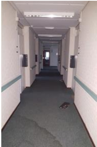
Figure 1.3 Indoor corridor on the first floor

Figure 1.3 below shows the indoor corridor on the first floor.