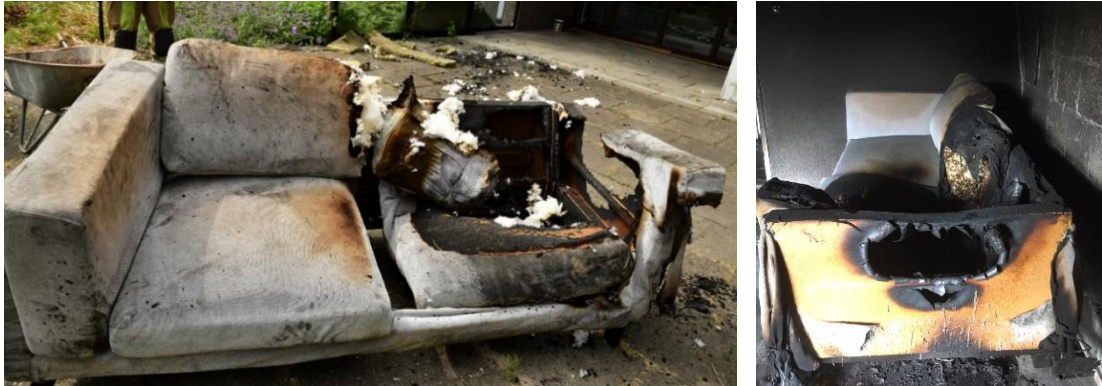
Figure 2.7 Pictures of the sofa after defensive interior tactic with door closed

The scenario 'door closed' with a defensive interior tactic resulted in a mass loss of approximately 6-8 kg. Figure 2.7 shows the pictures of the sofa that were taken after this experiment.