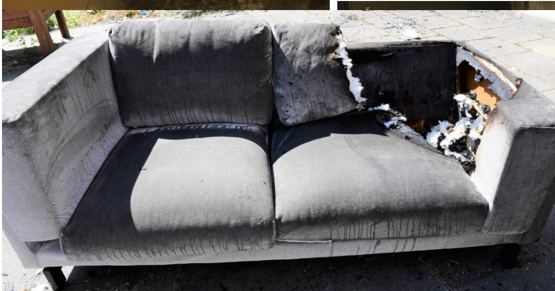
Figure 2.15 Effect mobile water mist system, offensive interior attack, door closed

In the scenario of the first experiment of the day the door was closed and an offensive interior attack was carried out. 21,5 minutes after the start of the fire the crew entered the fire room through the front door and started to extinguish the fire; 30 seconds later, it was extinguished. The mass loss of the sofa after the experiment was approximately 1-5 kg. The pictures in figure 2.15 show the sofa after the experiment.