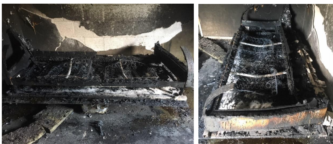
Figure 2.12 Maximum ventilation, offensive interior tactic

An offensive interior attack was applied during the first experiment. The balcony door was opened at the moment the fire was ignited. After 5 minutes the front door was opened as well, and remained open during the 50 minutes the experiment lasted. 21,5 minutes after the ignition, fire fighters entered the room and started to extinguish the fire. The signal 'fire out' was reported circa 1,5 minutes later. The mass loss of the sofa was 51-52 kg; the peak heat release rate was approximately 2.5-3.5 MW. Figure 2.12 shows the remains of the sofa after this experiment.