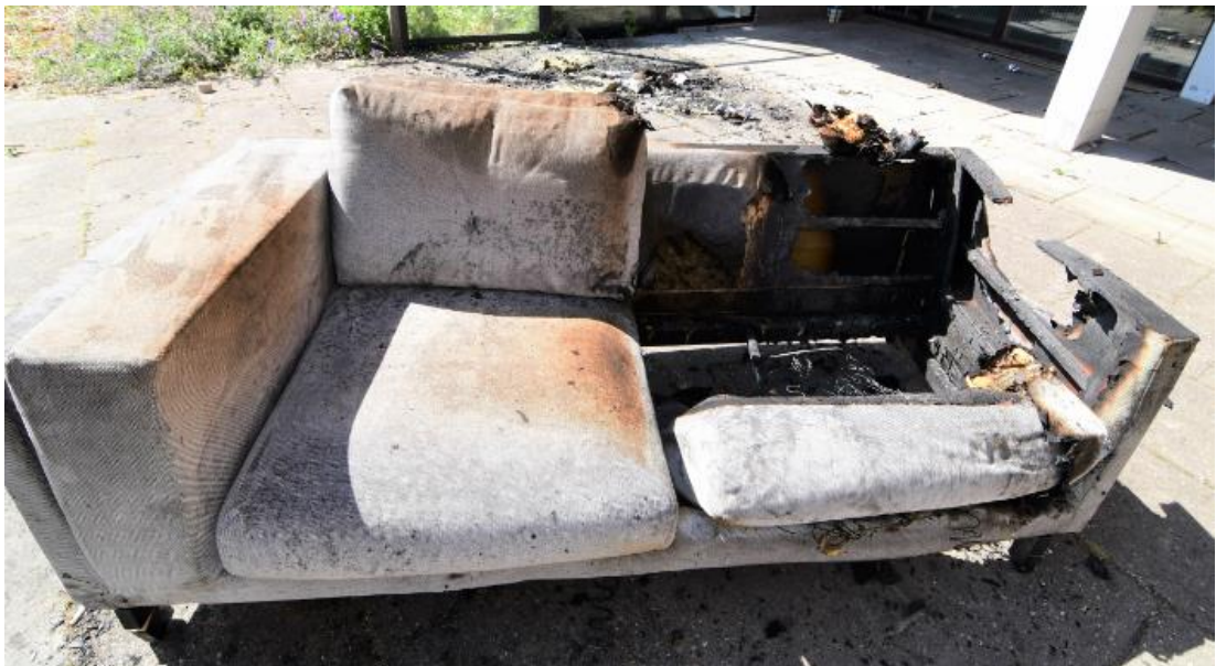
Figure 2.8 Pictures of the sofa after offensive interior attack with door closed

One of the experiment days, an experiment from the first day had to be repeated, because at the time the measurements of temperatures had failed. As this did not affect the combustion of the sofa, the pictures taken after the initial experiment are shown in this report (figure 2.8). The scenario with the offensive interior attack was repeated with the front door closed. The mass loss was approximately 8-9 kg and the peak heat release rate 1.2-1.6 MW.