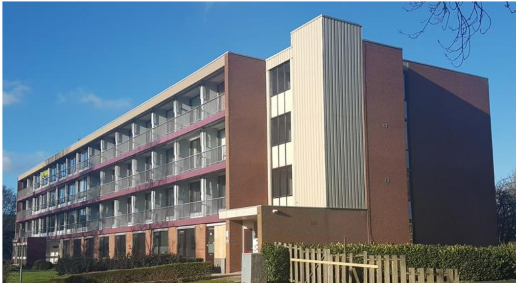
Figure 1.1: Residential building in Oudewater in which the experiments took place

building in Oudewater has four floors, which all have indoor corridors. Figure 1.1 shows a photograph of the building.