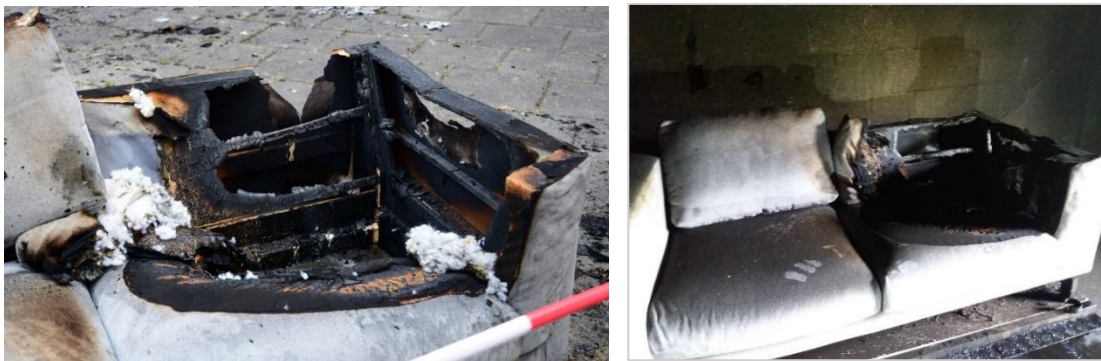
Figure 2.10 Effect of smoke-resistant separation, defensive interior attack

During the other experiment, a defensive interior attack was used. 35 minutes after the start of the fire, the crew entered the room and extinguished the fire. The mass loss of the sofa was approximately 6-7 kg, and the peak heat release rate 0.9 - 1.3 MW. Figure 2.10 shows pictures of the sofa, taken after this experiment.