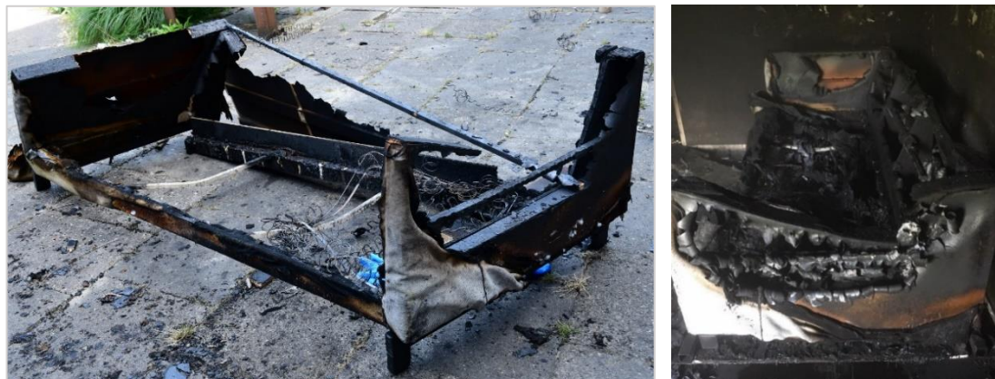
Figure 2.2 Pictures of the sofa after the second baseline measurement

Another baseline measurement took place during the second experiment week. Again, the front door was opened and there was no deployment by the fire service that could influence the growth of the fire during the experiment. The mass loss of the sofa was circa 28-29 kg. The peak heat release rate was 2.8-3.5 MW. Figure 2.2 shows the remains of the sofa.