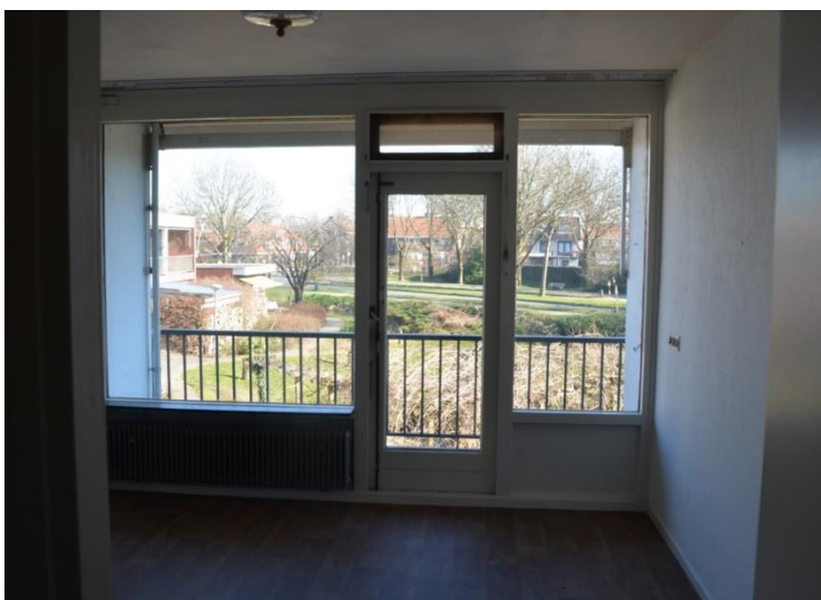
Figure 1.4 Picture of one of the fire rooms

The experiments took place in the living/bedroom of two apartments, hereafter referred to as fire rooms; the fires were started here. The rooms were carefully selected to obtain reliable and comparable results. The structure of the rooms, as well as the building itself, were intact, and fire safety measures according to the building regulations from 2012 were in place. The two fire rooms were identical in terms of layout. The rooms were used alternately: the first experiment (in the morning) took place in one fire room and the second experiment (in the afternoon) in the other. This was done to minimize the chance that the results of the afternoon experiments were affected by heat or other remains from the previous experiment. Figure 1.4 shows one of the fire rooms before preparation.