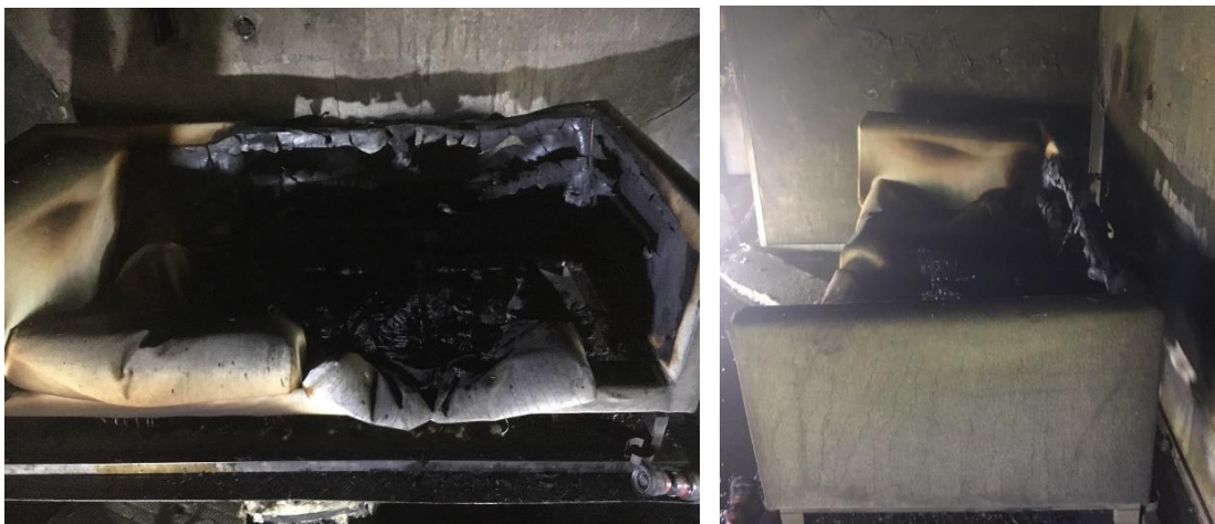
Figure 2.16 Effect mobile water mist system, defensive interior tactic, door open

In the second experiment of the day, again a mobile water mist system was used and a defensive interior attack tactic was carried out. The front door was opened 5 minutes after the ignition of the fire. 35 minutes after the start of the fire a fire hose was used to extinguish the fire. The mass loss of the sofa was approximately 10-20 kg. Figure 2.16 shows the pictures of the sofa that were taken after this experiment.