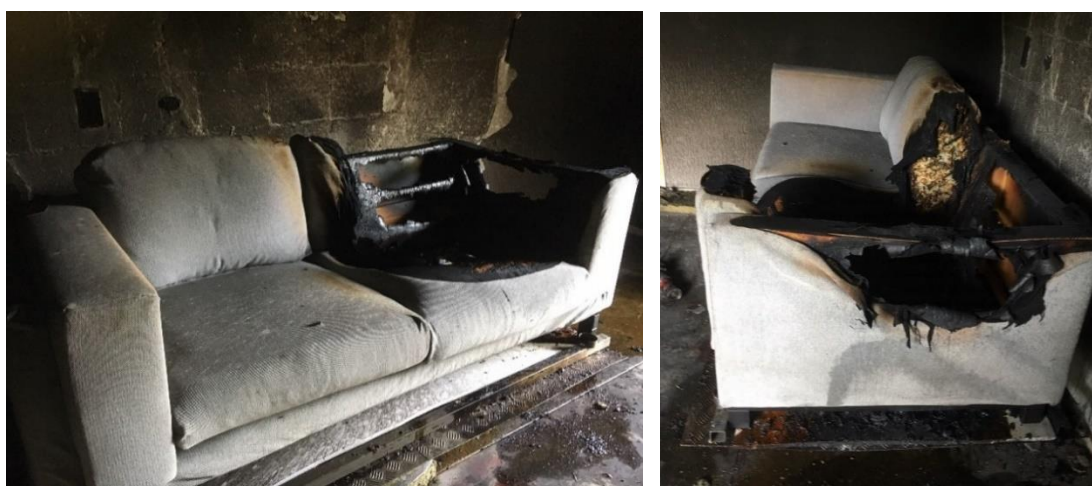
Figure 2.6 Pictures door closed, offensive interior attack

Two scenarios have been conducted in order to measure the effect of a closed standard front door on the fire spread and – most important – the effect on the smoke propagation. In the first scenario, the front door was opened and closed again by ‘an escaping resident’, represented by a member of the crew. This was done 5 minutes after the ignition of the fire. After t=5,5 the door was closed until the crew started the offensive interior attack. The front door was opened by the fire fighters 21,5 minutes after the ignition of the fire. After 22 minutes the fire fighters reported ‘fire out’. The mass loss of the sofa was approximately 5-10 kg. Figure 2.6 shows pictures of the sofa after this experiment.