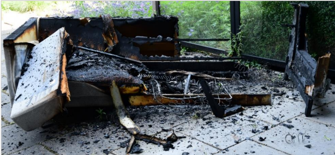
Figure 2.1 Pictures of the sofa after the first baseline measurement

Another baseline measurement took place during the second experiment week. Again, the front door was opened and there was no deployment by the fire service that could influence the growth of the fire during the experiment. The mass loss of the sofa was circa 28-29 kg. The peak heat release rate was 2.8-3.5 MW. Figure 2.2 shows the remains of the sofa.