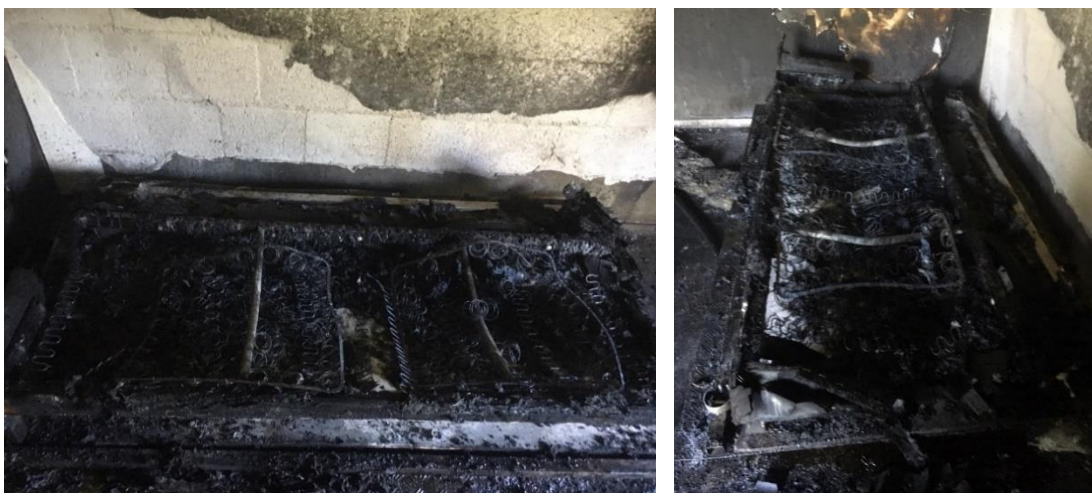
Figure 2.13 Maximum ventilation, defensive interior tactic

the fire room after 20 minutes and then closed the front door and the balcony door. 35 minutes after ignition, the fire fighters entered the fire room again and extinguished the fire. The mass loss was approximately 59-60 kg and the peak heat release rate 2.5-3.5 MW. Figure 2.13 shows the remains of the sofa after this experiment.