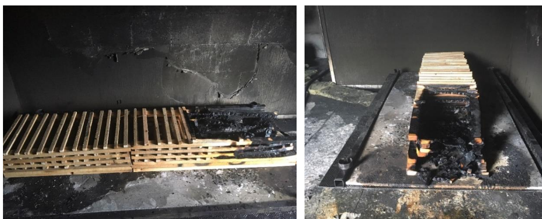
Figure 2.22 Effect of organic fire load, offensive interior tactic

First, the scenario with a closed front door and an offensive interior attack was used. The starting weight of the organic fire load was circa 21.7 kg. After 21,5 minutes the fire fighters entered the fire room and in less than 1 minute the fire was extinguished. The mass loss of the organic fire load was approximately 5-6 kg, and the peak heat release rate 0.1-0.2 MW. The pictures of the remains of the organic fire load are shown in figure 2.22.