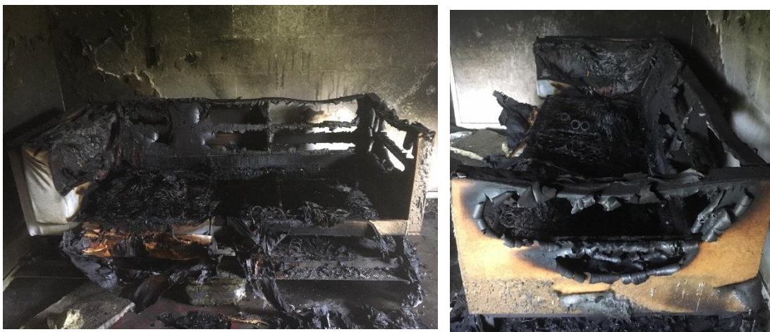
Figure 2.3 Pictures door open, defensive interior tactic

to the first experiment of the day. The pictures in figure 2.3 show that the sofa is more combusted, resulting in a lower weight of its remains.