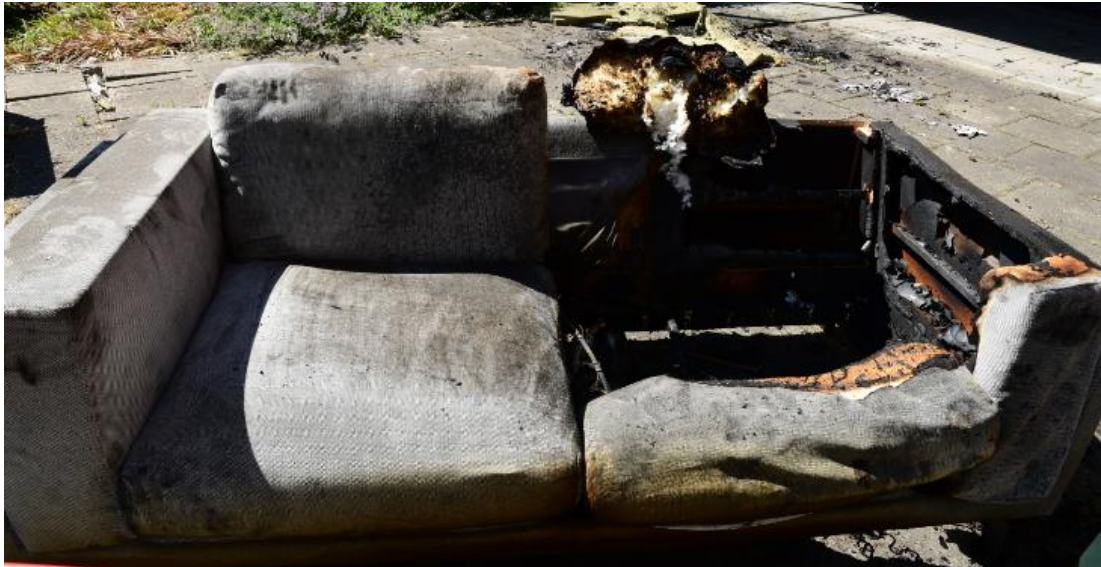
Figure 2.9 Effect of smoke-resistant separation, offensive interior attack

shows a picture of the sofa, taken after this experiment with a smoke-resistant door and an offensive interior attack.