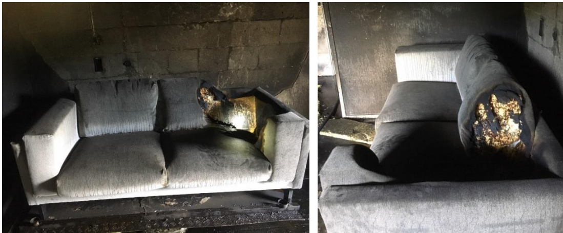
Figure 2.19 Effect smoke-resistant separation and mobile water mist system, offensive interior tactic

In the second experiment of the day a defensive attack was carried out. The mass loss of the sofa was approximately 1-5 kg. Figure 2.20 shows the pictures of the sofa, taken after this experiment.